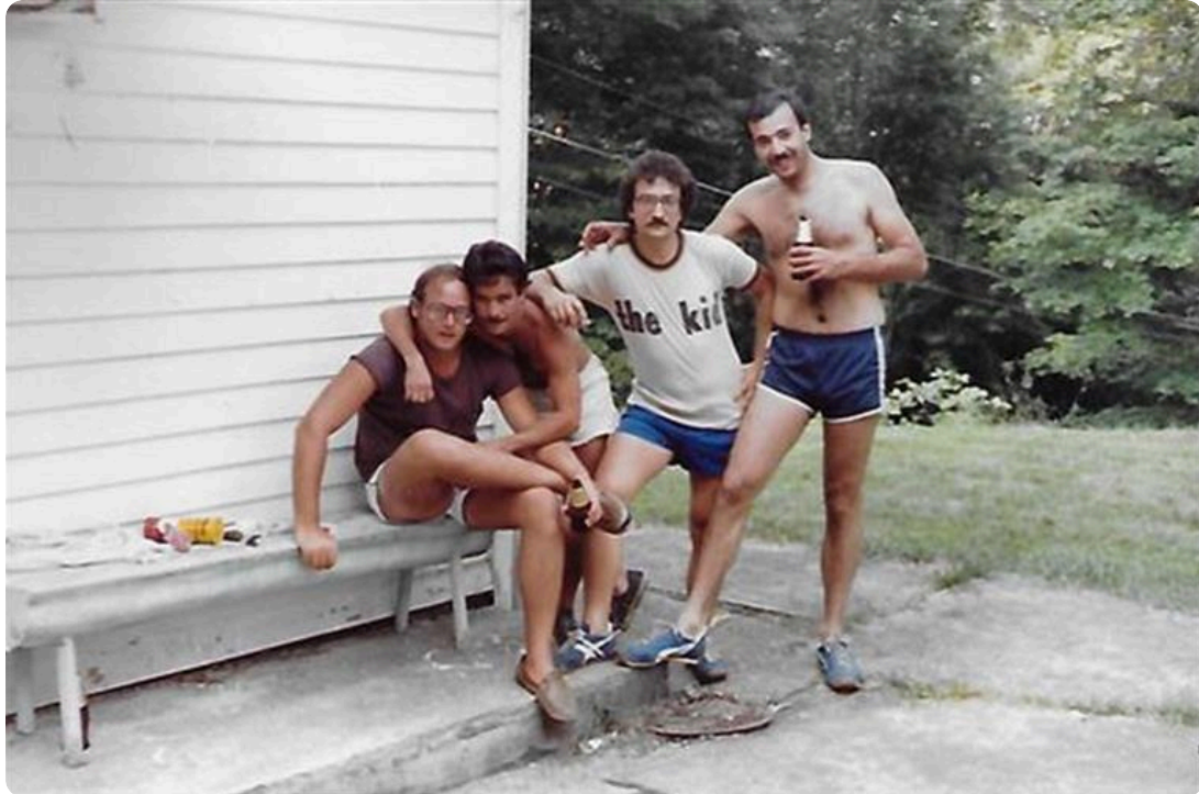
The Gang in the Poconos